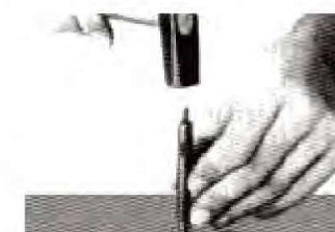
Take off the screw thread insert from the installation tool