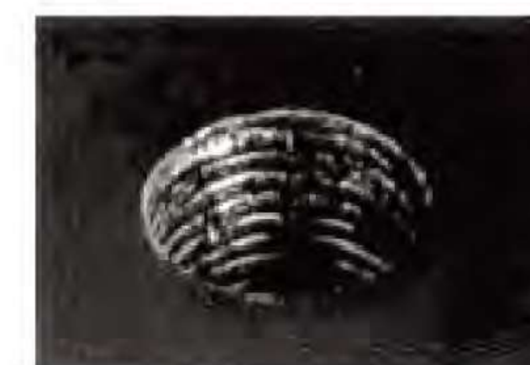
A damaged thread