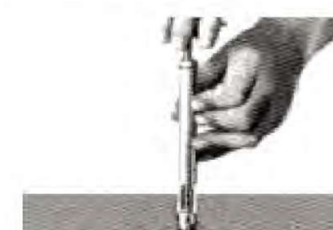
Install the screw thread insert with tool into the tapped hole