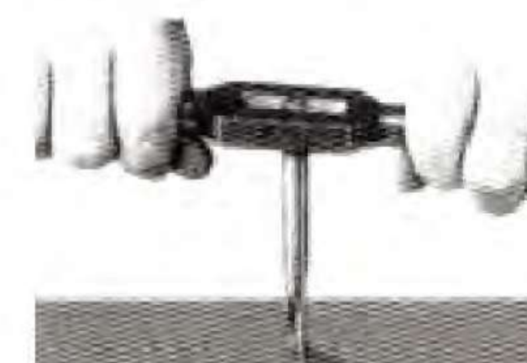
Tap new thread with a standard screw tap