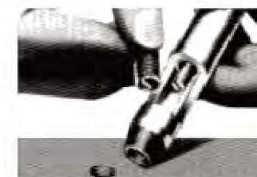
Fix the screw thread insert with the installation tool