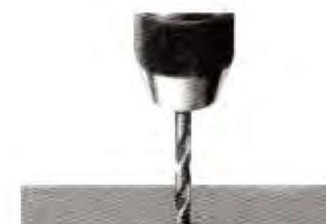
Drill out old thread with a standard drill